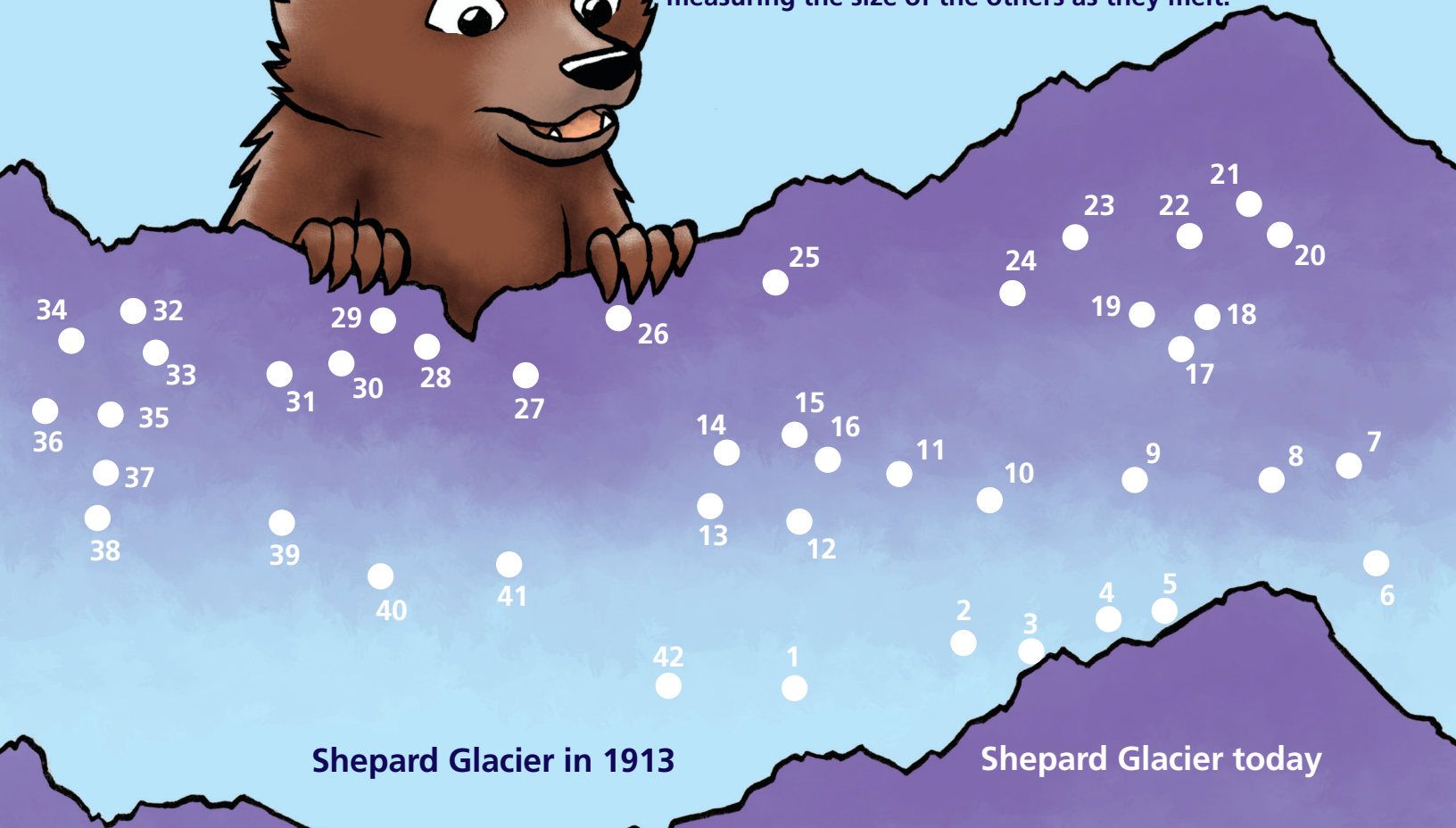
Shepard Glacier in 1913